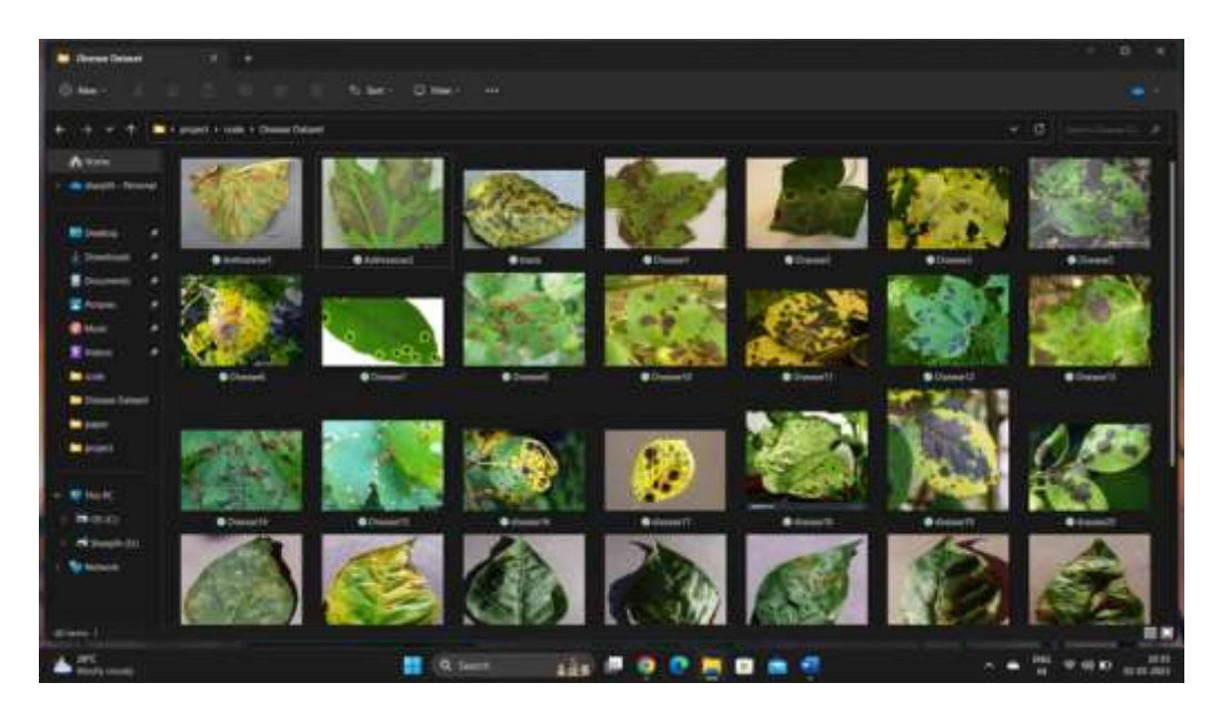
Figure.1. The Dataset of the model

Plant disease classification using SVM algorithm can be used to classify different types of plant diseases, including blackspot and anthracnose . Blackspot is a common fungal disease that affects rose plants, causing black spots on the leaves and stem. Anthracnose is another fungal disease that affects many plant species, including fruits and vegetables, causing dark spots on the leaves and stem. To classify blackspot and anthracnose using SVM algorithm, a dataset of labeled images of healthy and diseased plants affected by these diseases can be collected and preprocessed. Features such as color, texture, and shape can be extracted from the preprocessed images, and an SVM model can be trained using the extracted features. The SVM model can then be evaluated using a test dataset, and its performance can be measured using evaluation metrics such as accuracy, sensitivity, specificity, and F1 score.